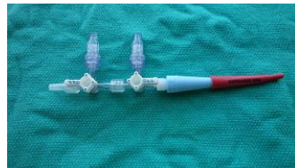
Esophageal Port Set-Up